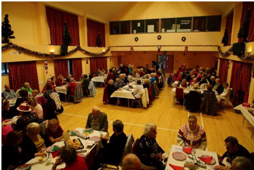
Members and Guests enjoying our Christmas Tea Party 2023