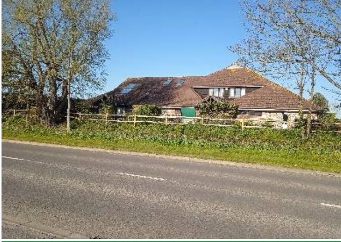
Pagham Village Hall where Pagham Parish Council Office is situated (view from Pagham Road)