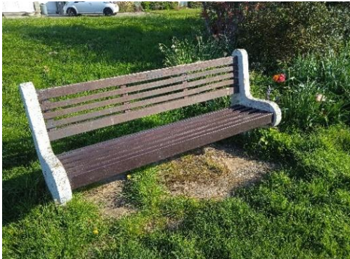
Recently repaired by Pagham Parish Council, this bench is sited on The Causeway and was presented to the village by the Pagham & Nyetimber Residents' Association in 1976 (now known as Pagham & District Residents' Association)